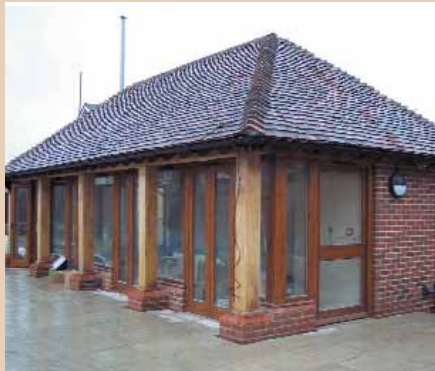
The new Café under construction

The second phase of the Project, namely the Café, is progressing well, with the oak framed building now constructed in the rear garden, and the fitting out due to commence shortly. The hard landscaping of the main section of the garden is now almost complete, with areas being left within the paved area for planters and decorative furniture to be installed.